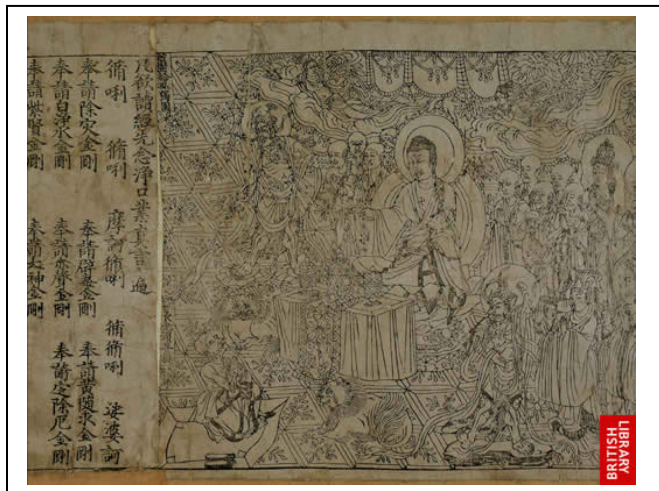
← Edition of Vajra Cchedika Prajna Paramita-sutra [ Diamond Sutra ], c. 868 CE, found in Cave 17, Dunhuang, China (British Library Or.8210/P.2)

-- Hevajra-tantra (c. 700 CE), trans. David Snellgrove