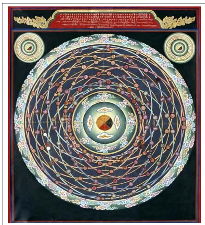
← Tibetan mandala incorporating Indra's Net motif

There is not the slightest difference between cyclic existence and nirvana. Nothing is mentally produced in the highest bliss, and no one produces it, There is... neither object nor subject... Calm is the Innate and undifferentiated... The Enlightened One is neither existence nor non-existence... So the whole world is the Innate, for the Innate is its essence. Its essence too is nirvana when the mind is in a purified state.